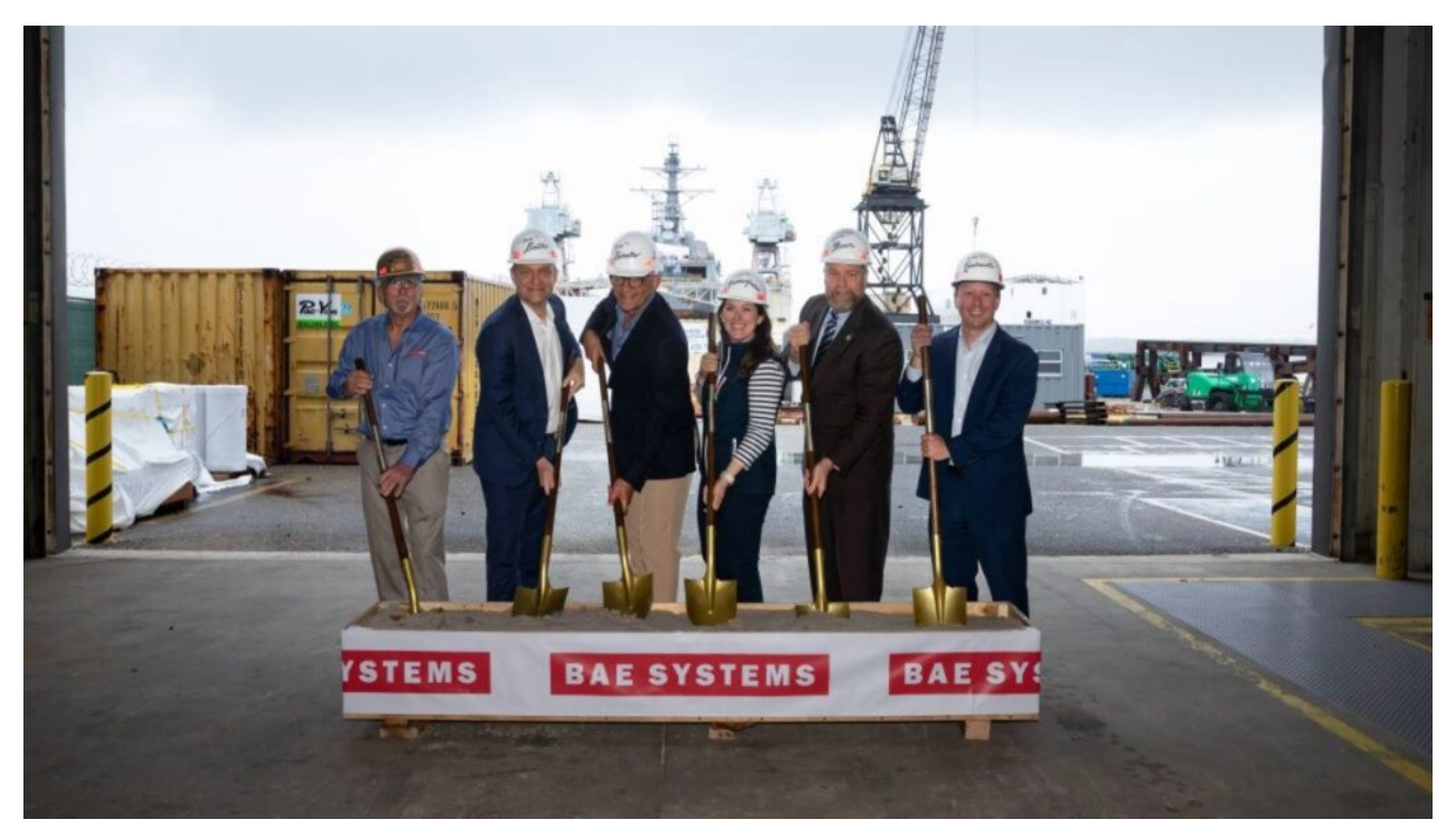
Release from BAE Systems