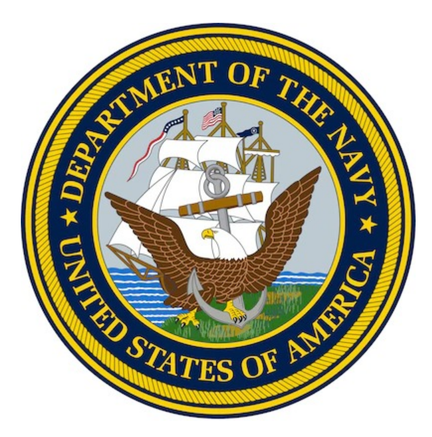
April 13, 2022

From Chief of Naval Operations Public Affairs