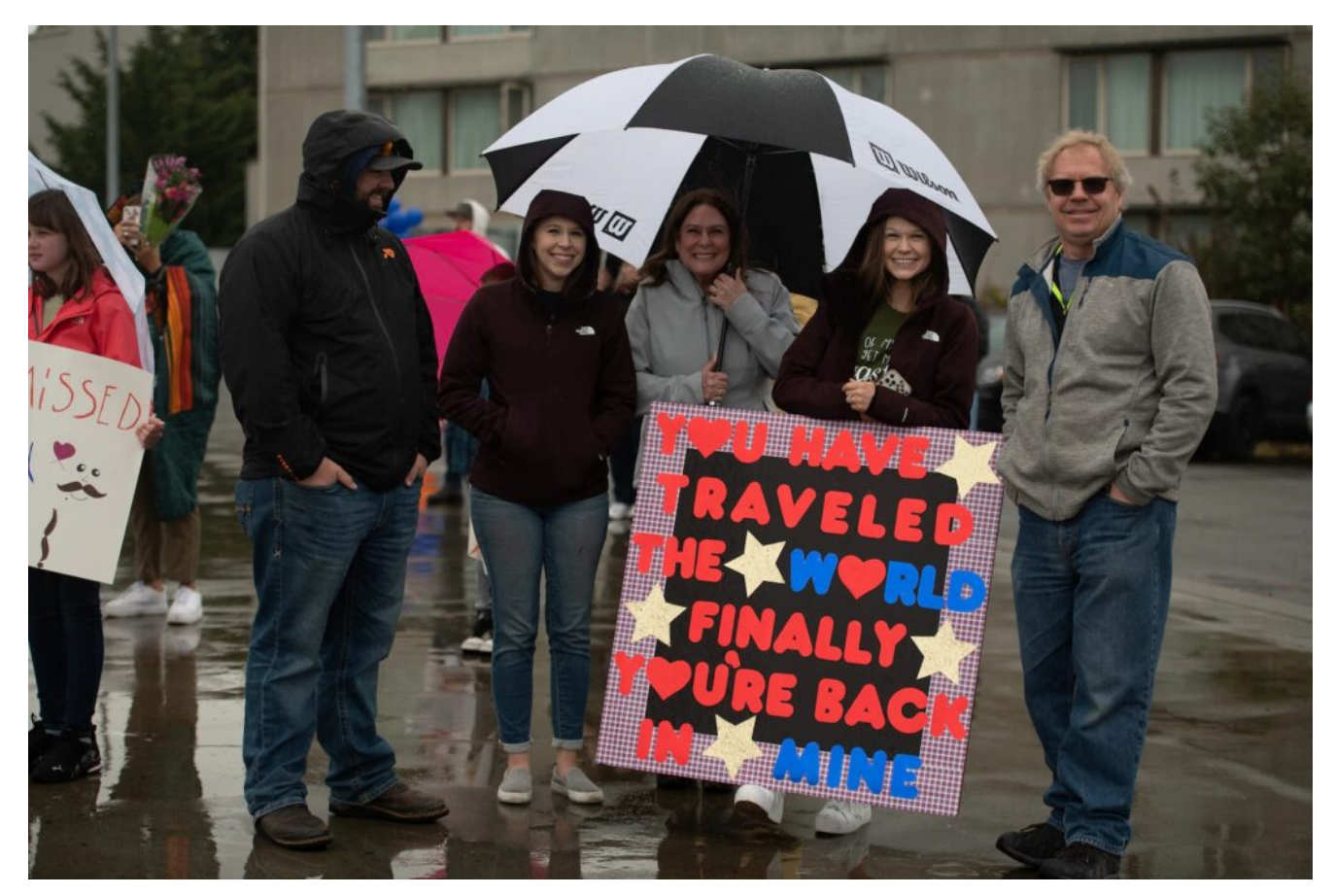
Release from Coast Guard Pacific Area