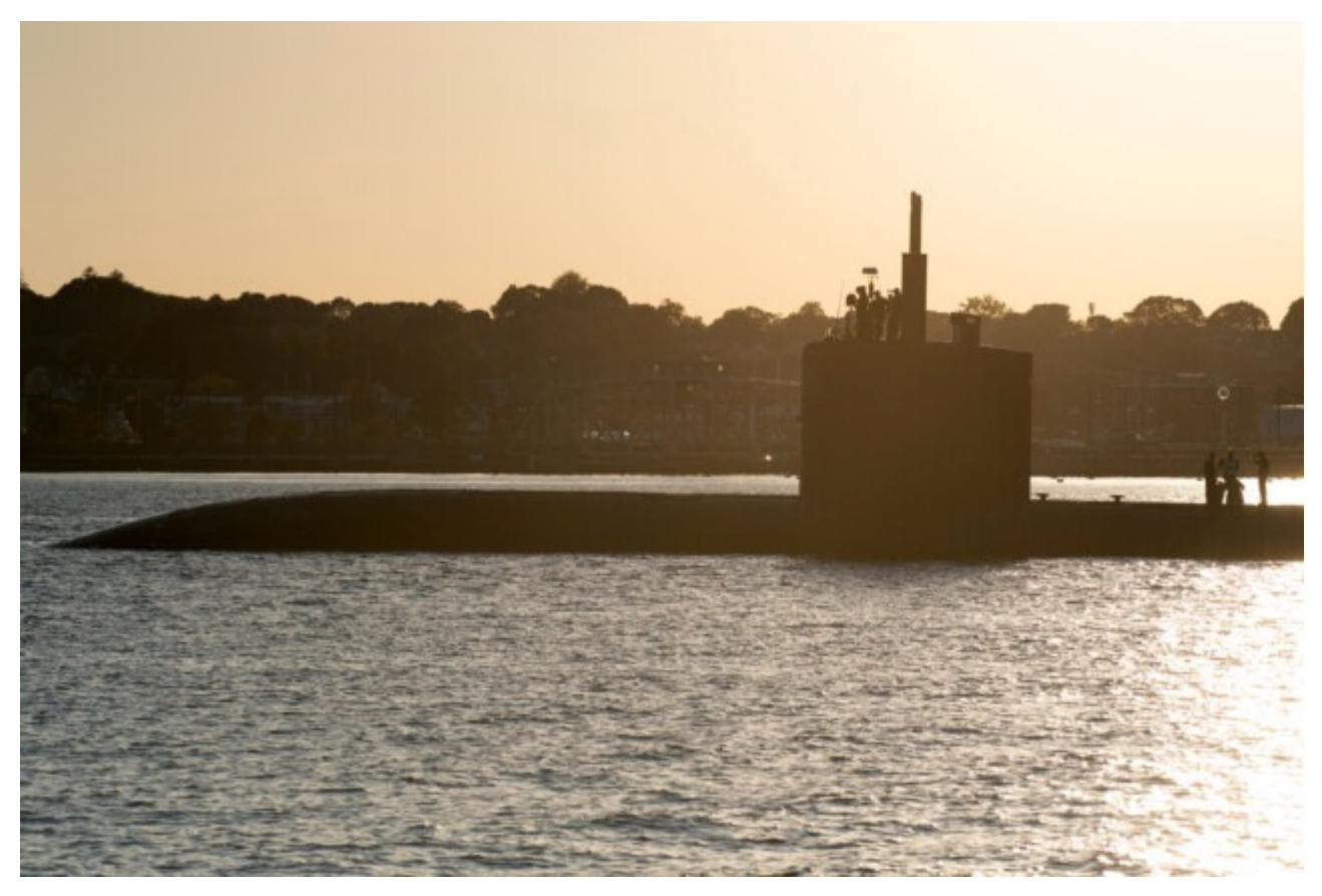
Release from Rite-Solutions