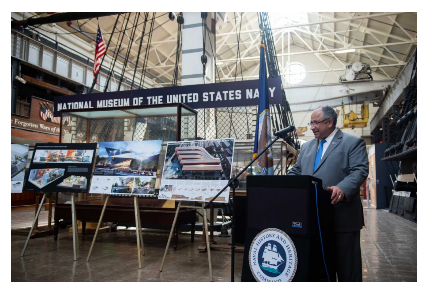
Release from Navy History and Heritage Command