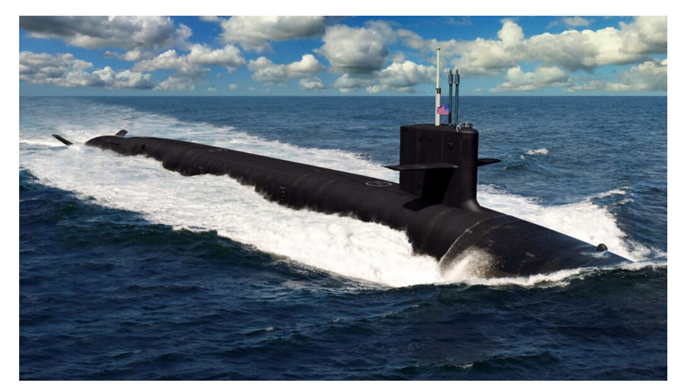
Release from HII