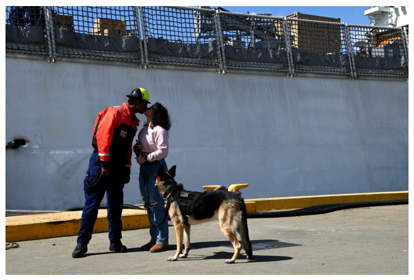
Release from Coast Guard Pacific Area