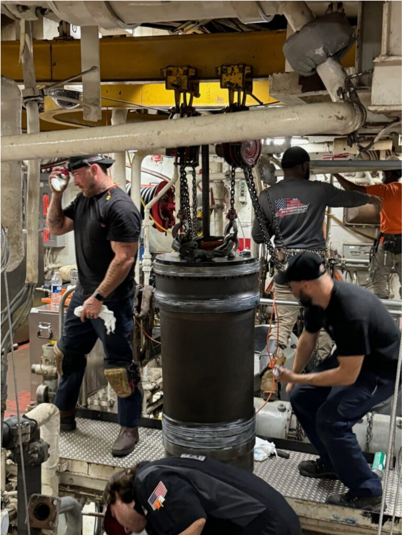
Fairbanks Morse Defense workers overhaul an engine using the "pit stop" method. Imagine if a Navy ship could pull into a pit stop like a race car, get its engine overhauled and be back on the seas in less