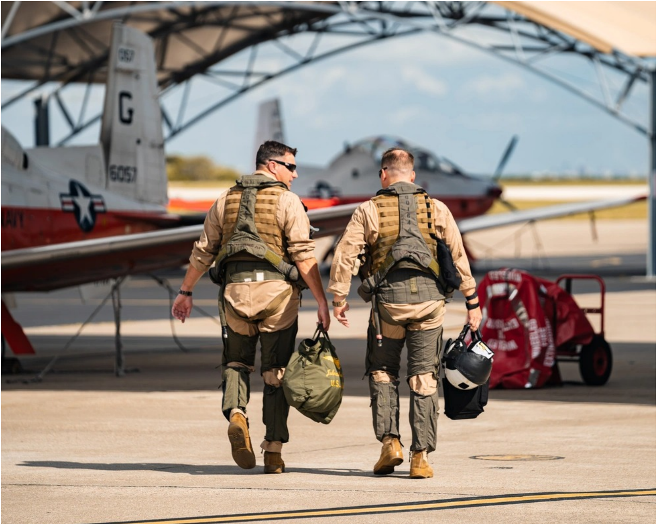
By CNATRA Public Affairs

CORPUS CHRISTI, Texas – The Chief of Naval Air Training (CNATRA) has been awarded the Meritorious Unit Commendation (MUC) by the Chief of Naval Operations in recognition of its exceptional performance in training student naval aviators. This honor highlights CNATRA’s commitment to excellence in naval aviation training from October 2022 to March 2024.