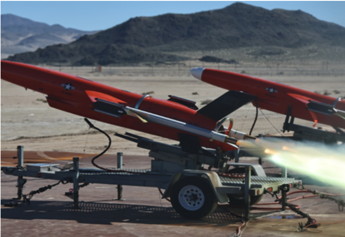
BQM-177A Subsonic Aerial Target Systems From Kratos Defense & Security Solutions, March 6, 2025

SAN DIEGO, March 06, 2025 (GLOBE NEWSWIRE) – Kratos Defense & Security Solutions, Inc. (NASDAQ: KTOS), a Technology Company in the Defense, National Security and Global Markets, and industry-leading provider of high-performance, jet-powered unmanned aerial systems, announced today that Kratos has received $59,338,010 for an additional 70 BQM-177A Subsonic Aerial Target (SSAT) aircraft through the exercise of the contract option for Full Rate Production (FRP) Lot 6. When combined with the base award and exercise of FRP Lot 5, the resulting overall value of FRP Lots 4 through 6