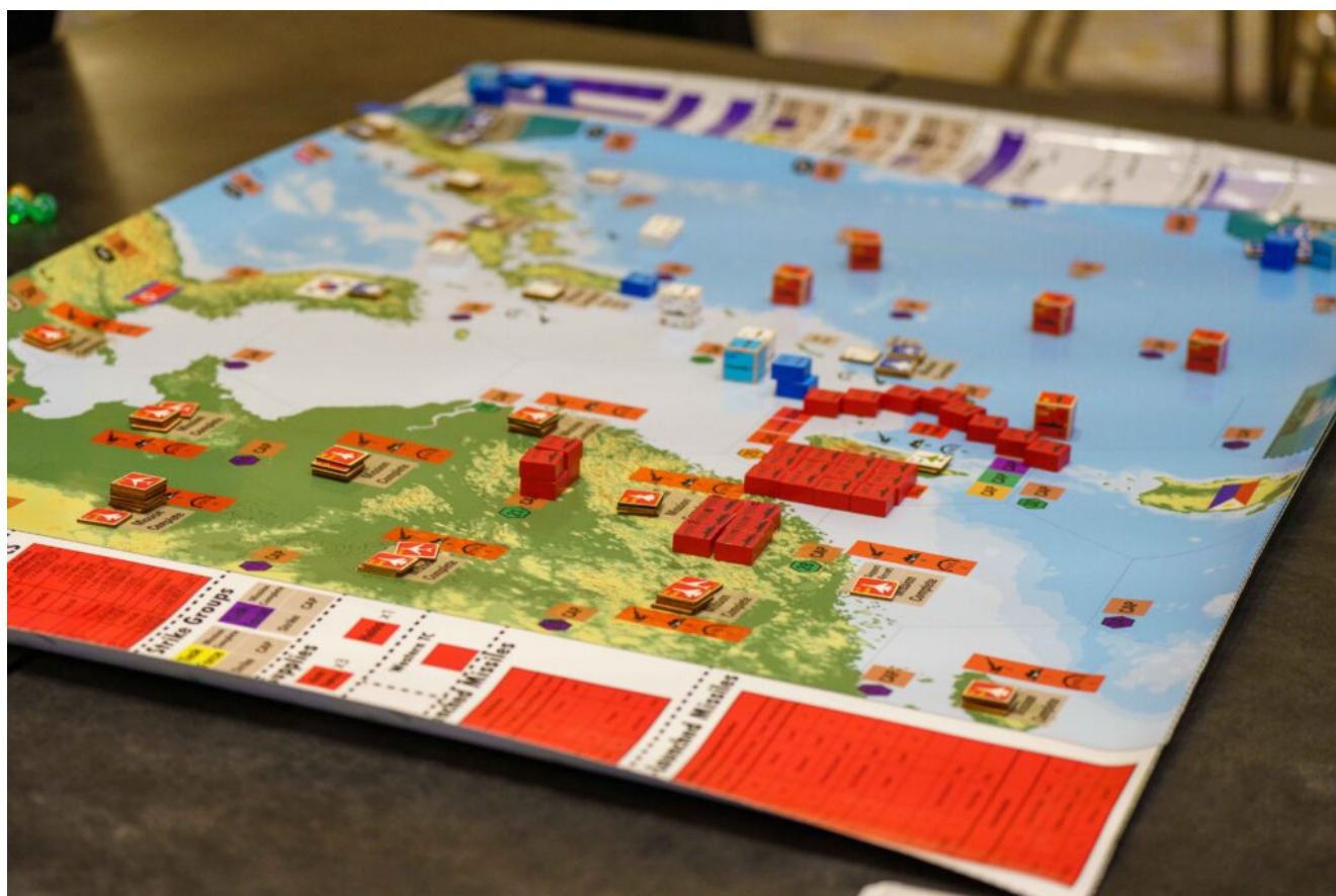
The board at last year's wargaming event.

Some wargame results are interpreted as the “sure path to victory,” or the “inevitable road to defeat” depending on who reads the results and how they interpret them. Wargame results are sometimes seen as either confirming the rise of a specific weapon system or the condemnation of another to obsolescence. These are false interpretations of game results. First, wargames are only as “good” as their input data. That not only includes order of battle being correct, but also, when available, aspects of gaming that the Naval War College calls “the intangible aspects of military planning.” How “ready is any one opponent ship, aircraft, or submarine in terms of material readiness? Can that platform perform its intended mission as designed?