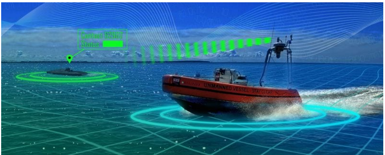
An illustration of Spatial Integrated Systems’ capabilities in