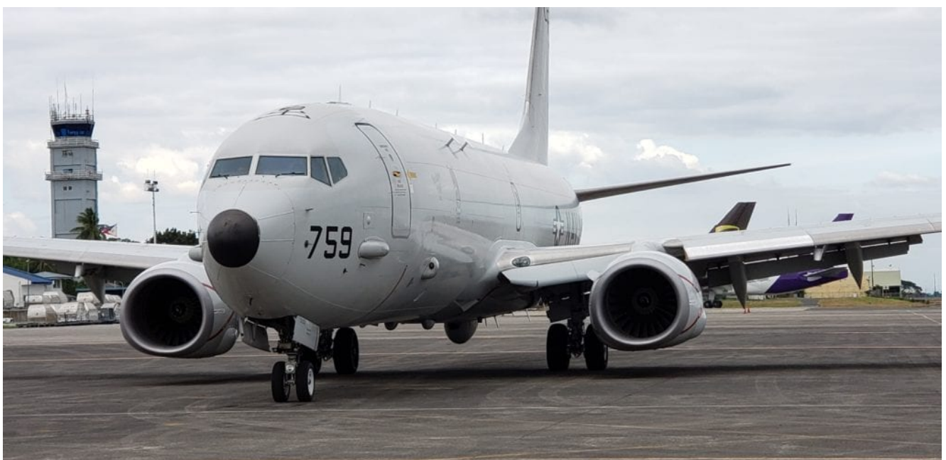
A P-8A aircraft 759 arrives at its parking spot in this 2019