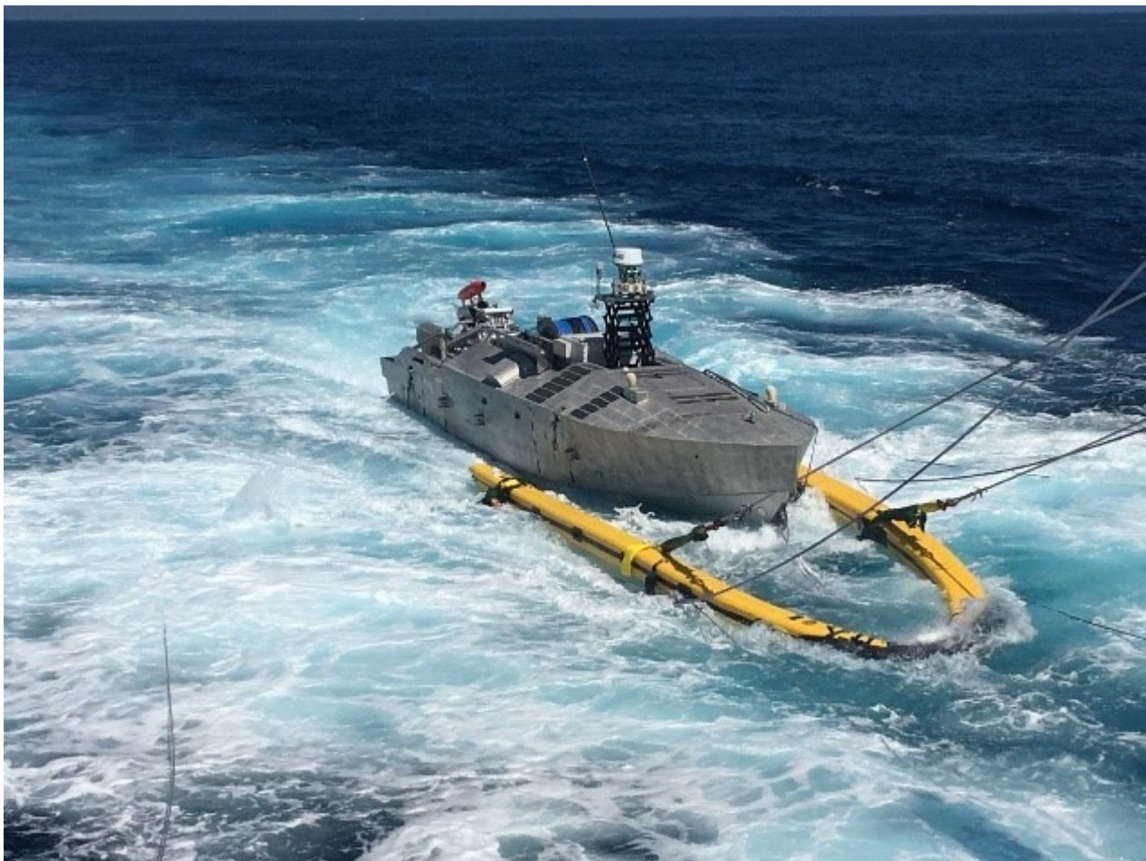
The Mine Countermeasures Unmanned Surface Vehicle.