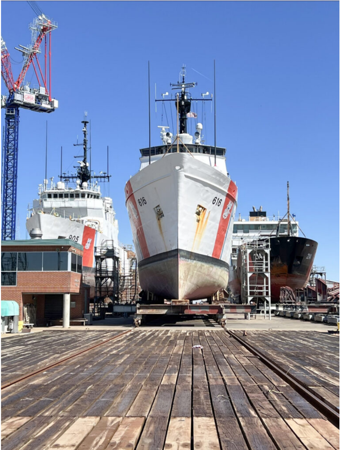
U.S. Coast Guard Cutter Diligence (WMEC 616) is hoisted on blocks while in dry dock, March 21, 2024, at the Coast Guard Yard in Baltimore, Maryland. Diligence conducted a two-month living marine resources patrol in the Gulf of Mexico and