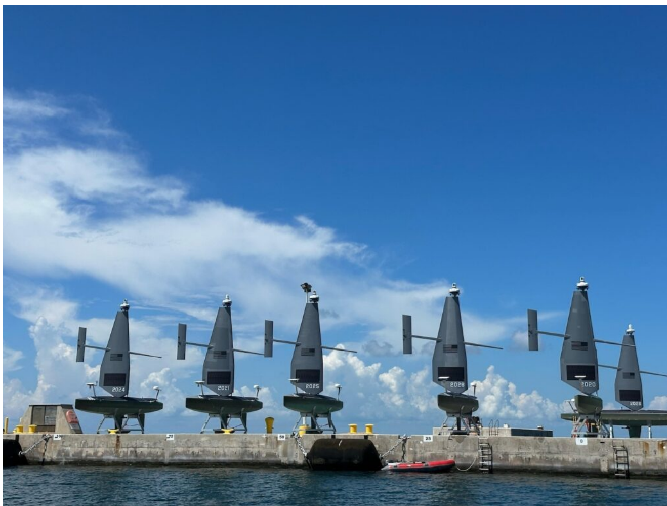
230913-N-N3764-1001 NAVAL STATION KEY WEST, Fl. – (Sept. 13, 2023) – Commercial operators deploy Saildrone Voyager Unmanned Surface