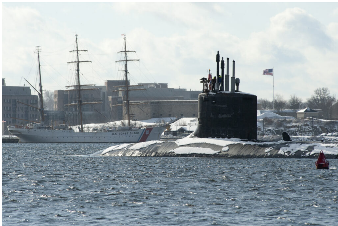
The Virginia-class submarine USS Indiana (SSN 789), a sister