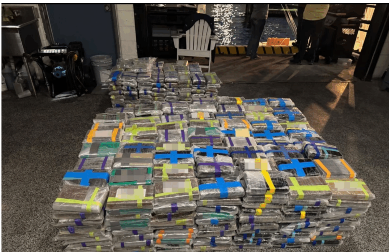
Law enforcement crews from U.S. Coast Guard Station Miami