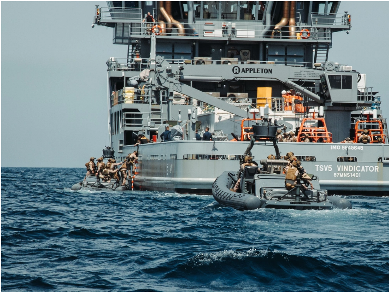
May 18, 2025

ATLANTIC OCEAN – U.S. Marines with Maritime Special Purpose Force, 22nd Marine Expeditionary Unit, board a vessel in rigid-hull inflatable boats while conducting maritime interception operations aboard U.S. Navy training support vessel USNS Vindicator (TSV 5) in support of Iwo Jima Amphibious Ready Group Marine Expeditionary Unit Exercise (ARGMEUEX) while underway in the Atlantic Ocean, May 18, 2025. During ARGMEUEX, the 22nd MEU, aboard IWO ARG shipping, conducts various mission essential tasks that enhance operational readiness and lethality as a unified IWOARG/22 MEU team.