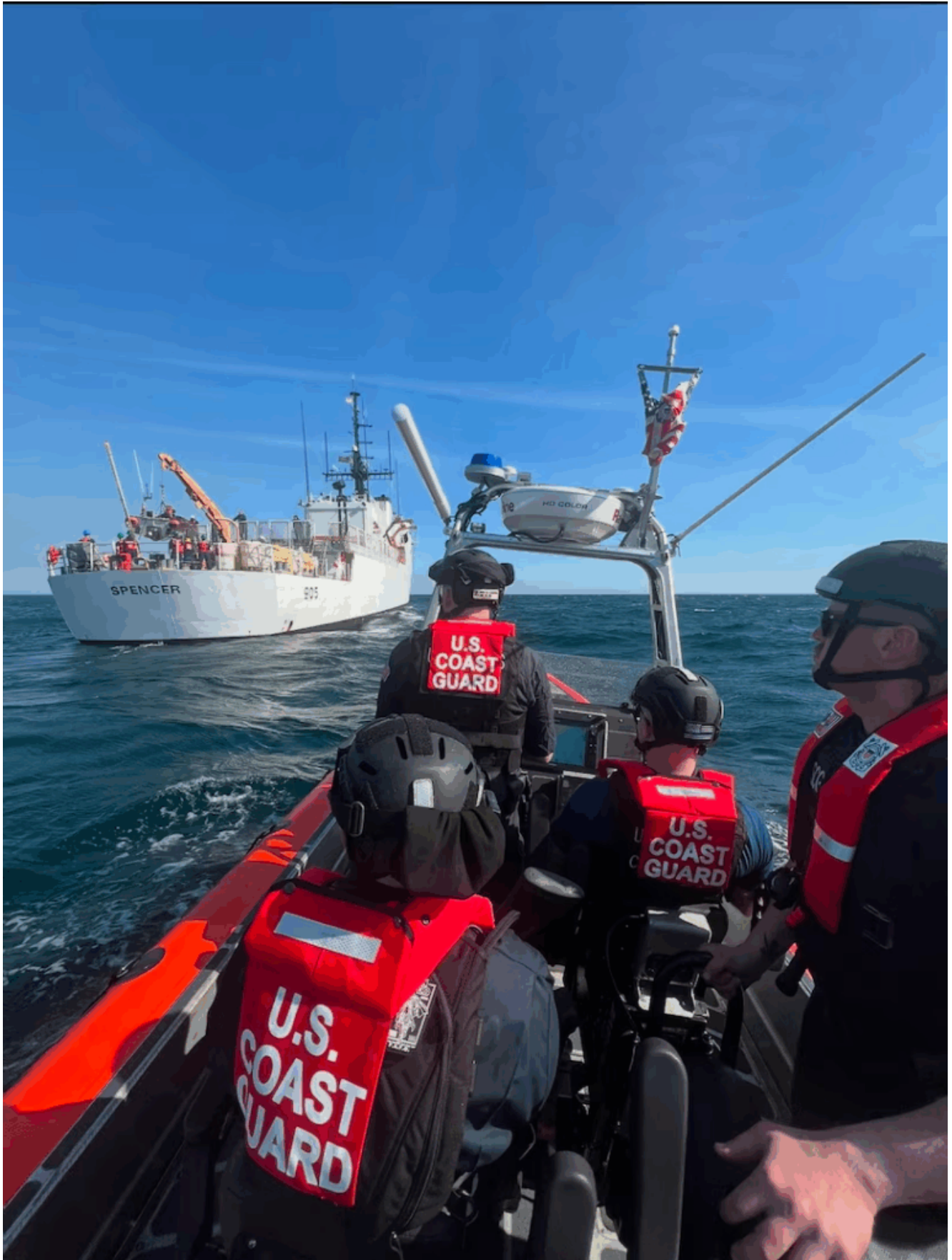
Coast Guard Cutter Spencer (WMEC 905) crew member conduct small boat operations while patrolling the Florida Straits, March 21, 2025.