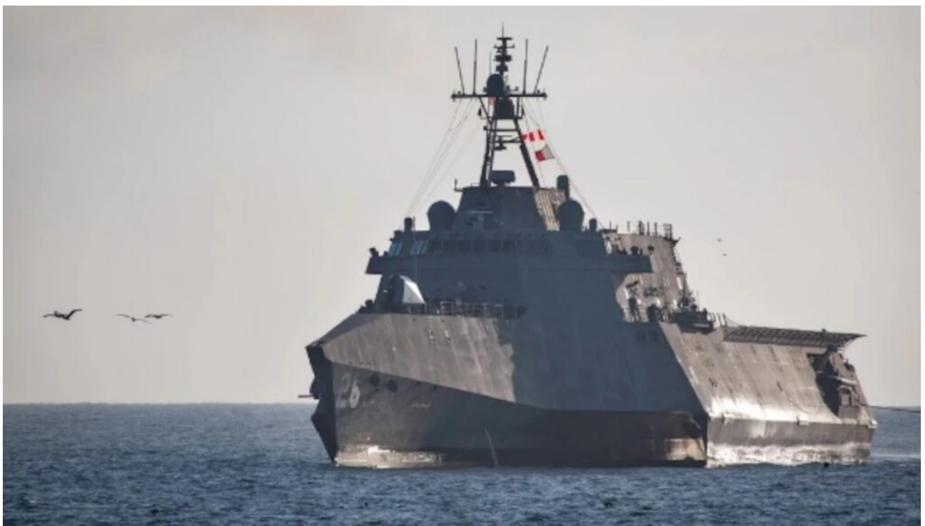
USS Mobile (LCS 26) heads towards Naval Surface Warfare