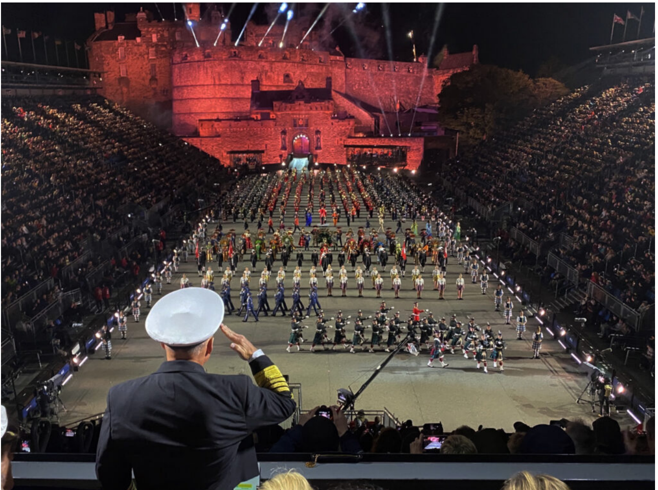
Chief of Naval Operations Adm. Mike Gilday renders a salute as