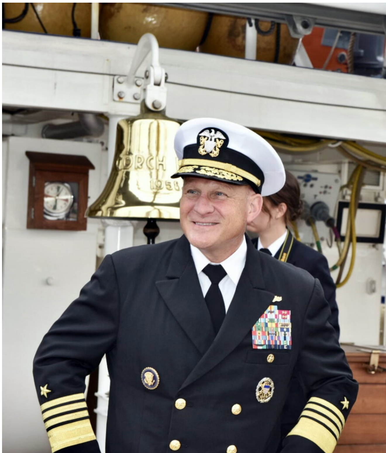
Chief of Naval Operations Adm. Mike Gilday visits the German training ship Gorch Fock during BALTOPS 22.