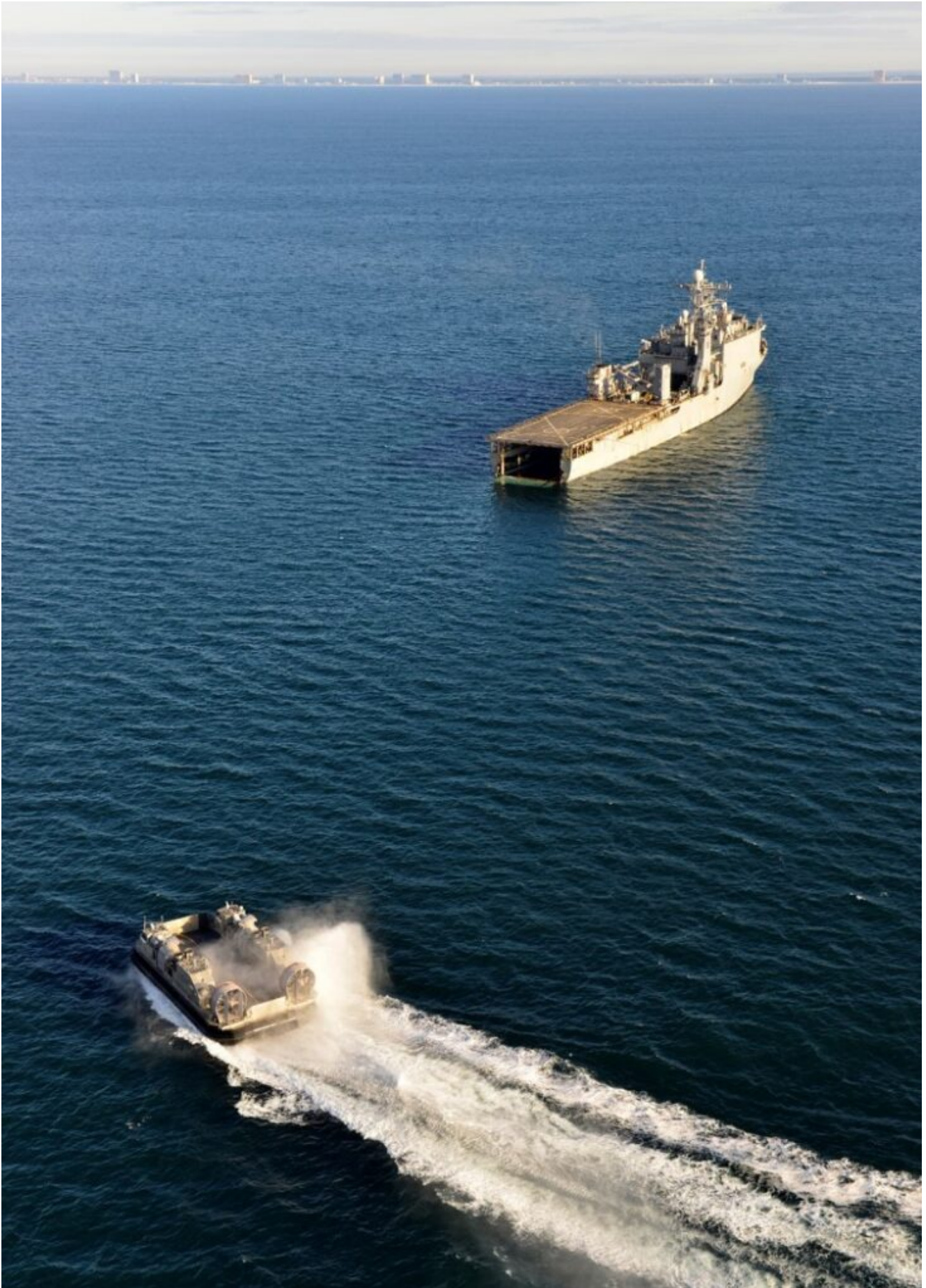
The next generation landing craft, ship-to-shore connector, landing craft, air cushion (LCAC), successfully completed well