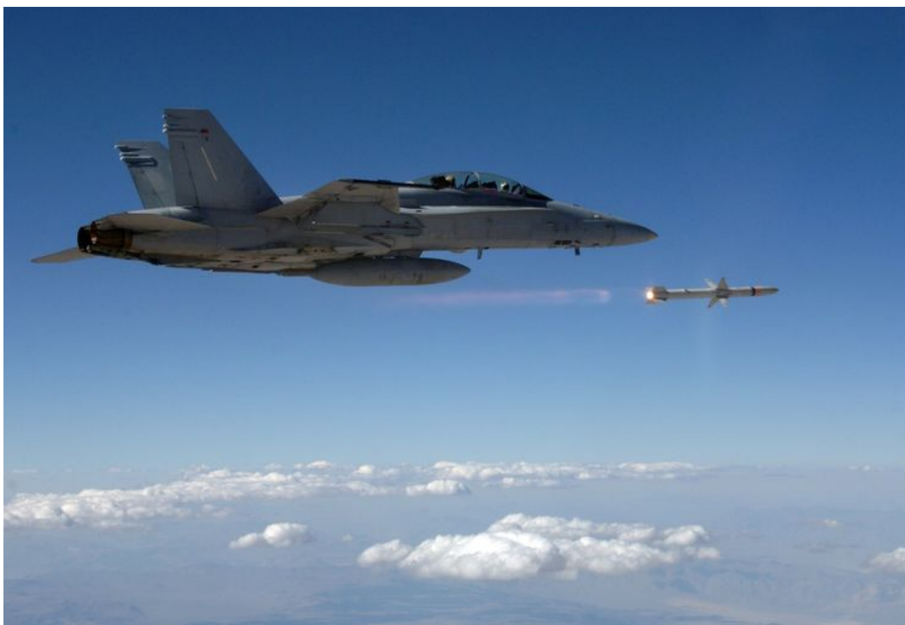
An AGM-88E2 AARGM is launched from an F/A-18 during testing.