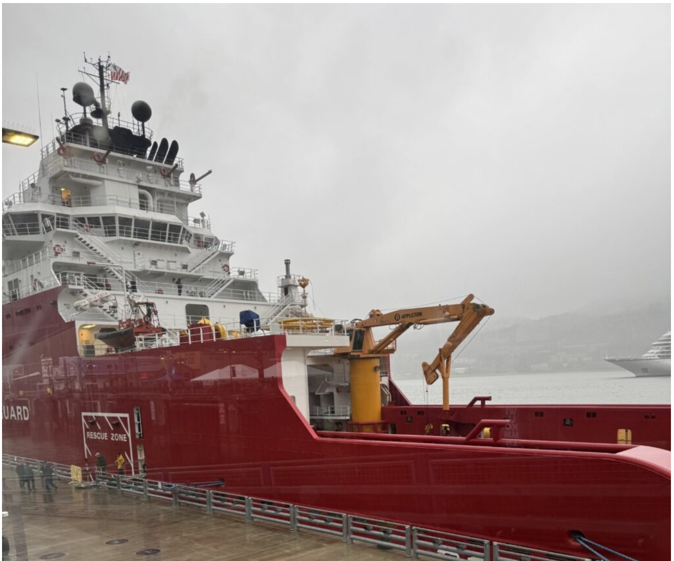
The Coast Guard Cutter Storis in Juneau for its commissioning