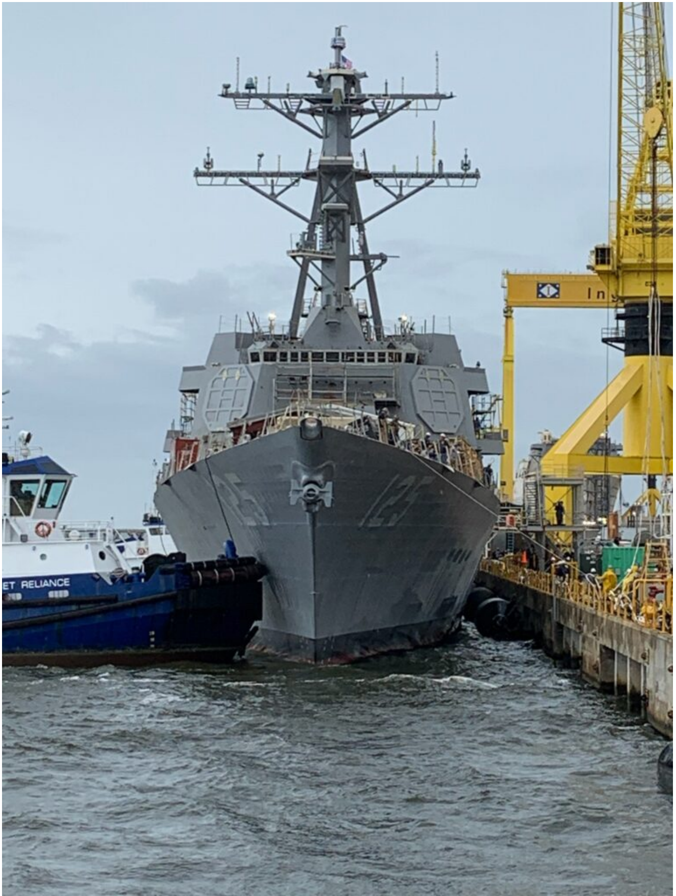
The future Jack H. Lucas (DDG 125), an Arleigh Burke-class guided missile destroyer (Flight III configuration) successfully launched at Huntington Ingalls Industries, Ingalls Shipbuilding division, June 4, 2021. HUNTINGTON