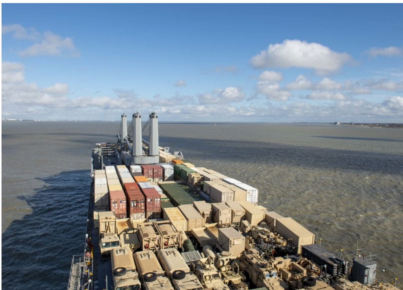
The U.S. Military Sealift Command large, medium speed roll-on/roll-off ship Benavidez transits the English Channel. U.S.